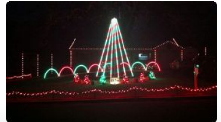
Holiday Lights Around Berks